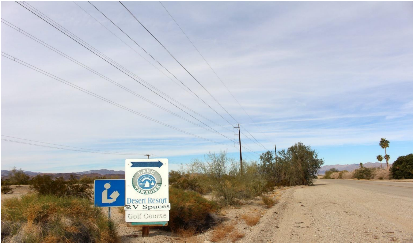
After dust abatement