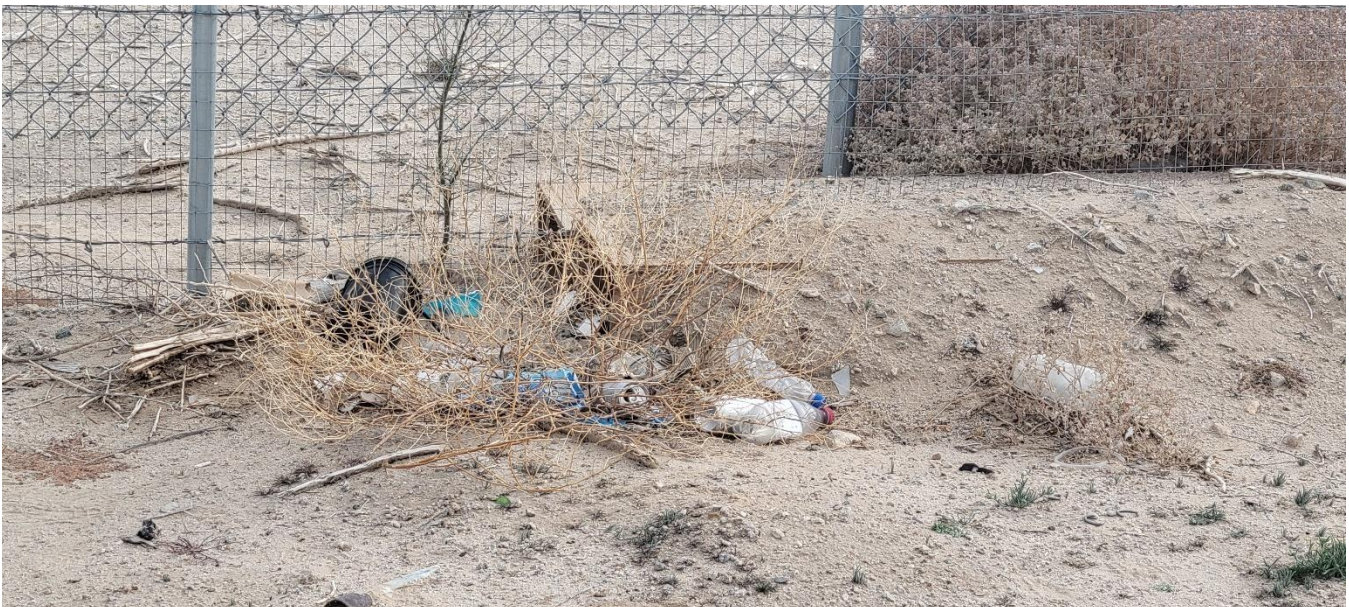
December of 2022

Turtle/kitt fox box for shade (not accessible or maintained)