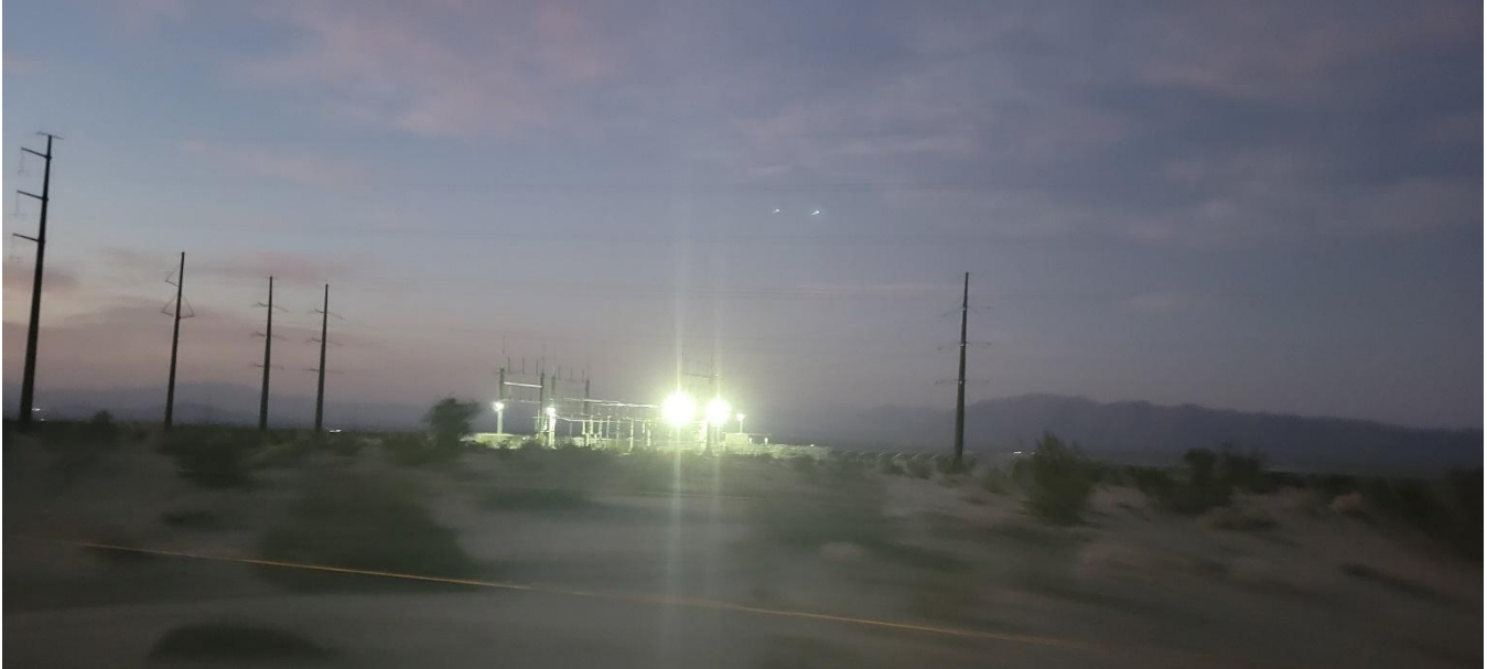
December 2022