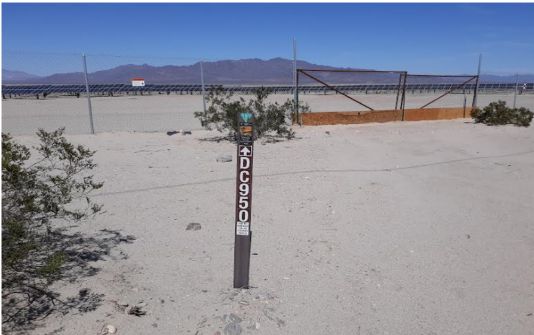
^Palen Solar Project east of Desert Center. This entire public road was cut off for the project.